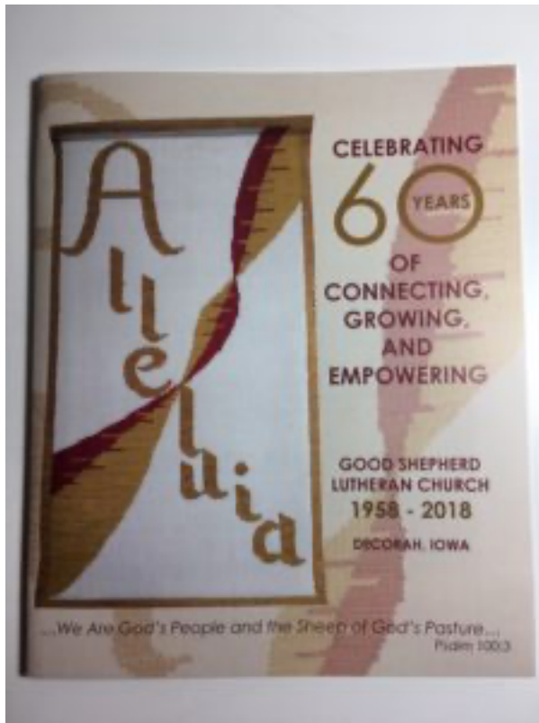
Anniversary History booklet